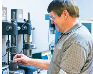
Client Employment Program

The Employment Program started mostly as a program of job readiness. There was a group that discussed job search, resume writing, interviewing skills, applications and follow up.