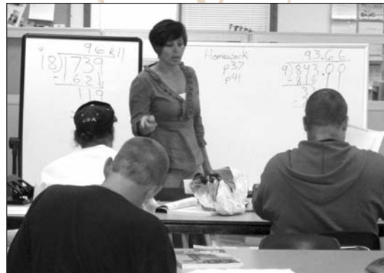
Students in our GED preparation class at our daytime Support Center review long division.