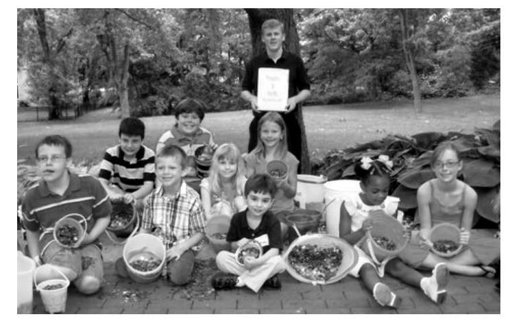
Sunday school students from Southminster Presbyterian in Glen Ellyn collect $892 in pennies for the Get on the Bus program.