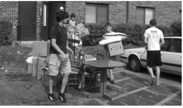
High school students help out on moving day for a Supportive Housing Tenant.