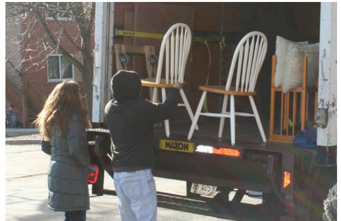
Moving Day! Volunteers and staff help move furniture.

For these clients, their apartments represent a fresh start and a way to come back to a place of dignity and belonging in our community. We are grateful for your support of our mission as well as the tremendous support of our partners in the community who helped make this happen.