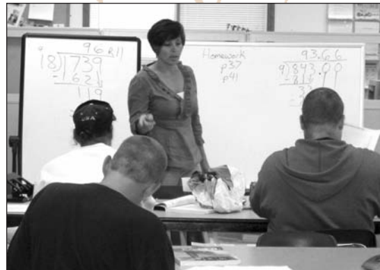
Students in our GED preparation class at our daytime support center review long division.