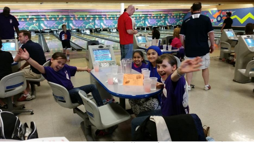
Fun for all ages!