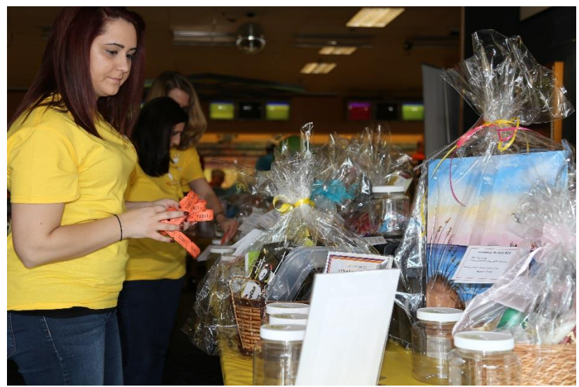
Raffle prizes and silent auction items