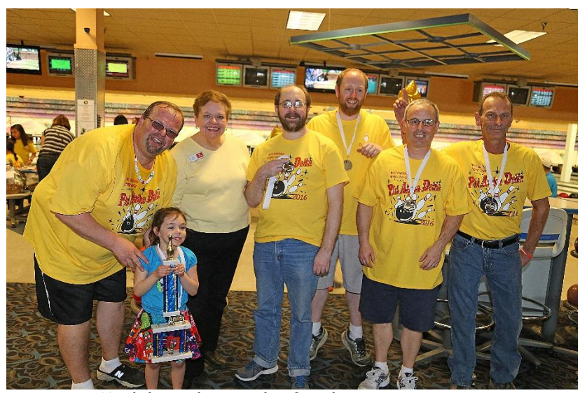
Medals and a trophy for the winning team