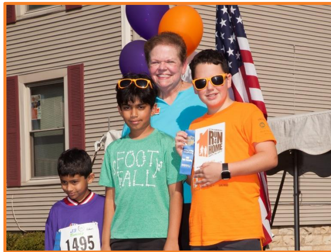
Top fundraising teams receive an award