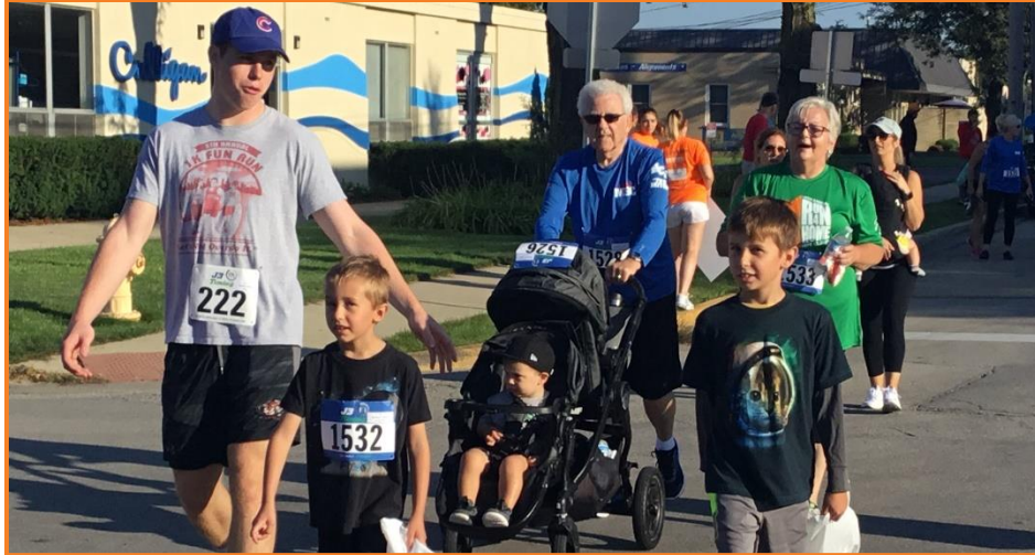
Family friendly event