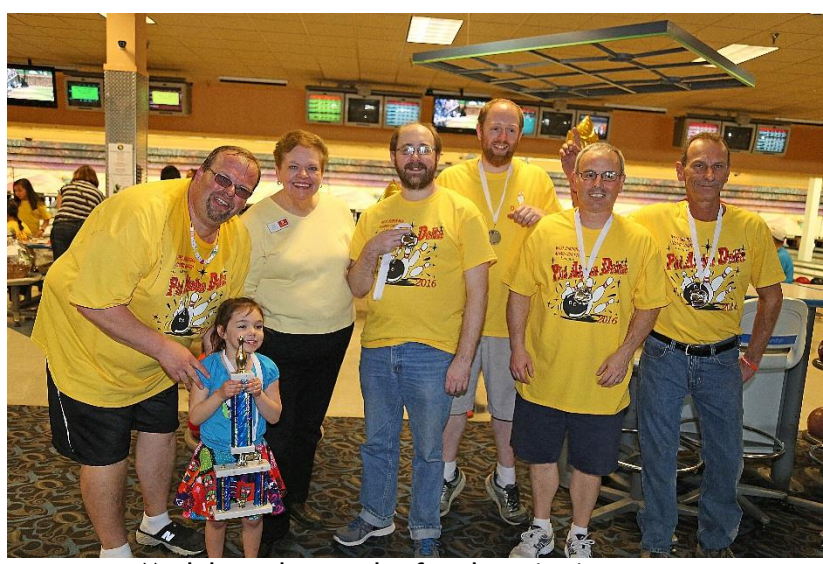
Medals and a trophy for the winning team