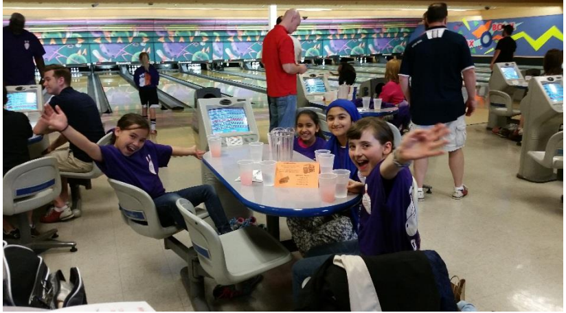
Fun for all ages!