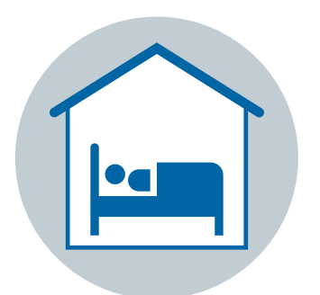
Stay home while you are sick; avoid others