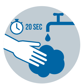
Wash hands often