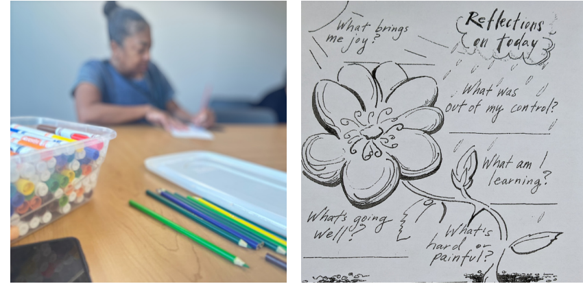
Art Therapy Class at the Empowerment Center

From its doors, DuPagePads' education liaison was able to connect 136 children to school, and, thanks to Pads' volunteer tutors, many of the children in the program have made great strides, from learning to read, to changing their grades from Cs and Ds to all As and Bs. Vocational staff were also able to help 82 clients find employment and hosted Transforming Impossible to Possible (TIP) classes on-site.